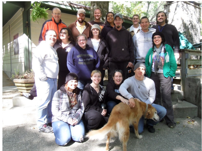
STATE YOUTH FELLOWSHIP