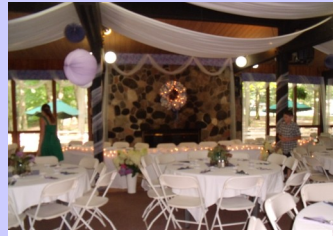
LECHNER/BUSSCHER WEDDING RECEPTION