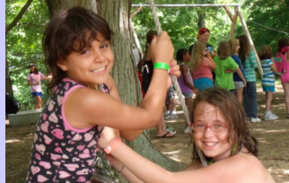
RIVER OF GOD