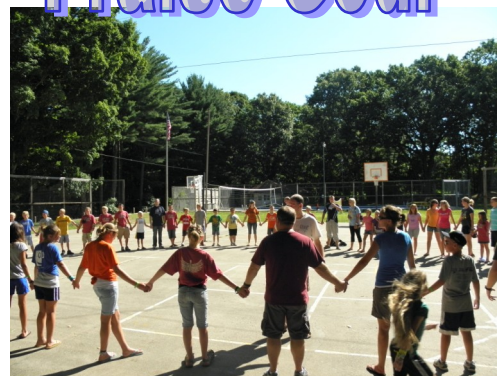
Closing Ceremony - South Olive Bible Camp—July 2011.